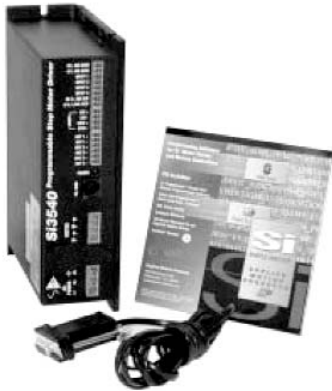
SMD3540CSi Programmable Step Motor Drive